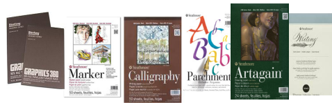
Bienfang Graphic 360, Strathmore Marker 500 Series, Strathmore Calligraphy, Parchment, Artagain & Writing Paper.